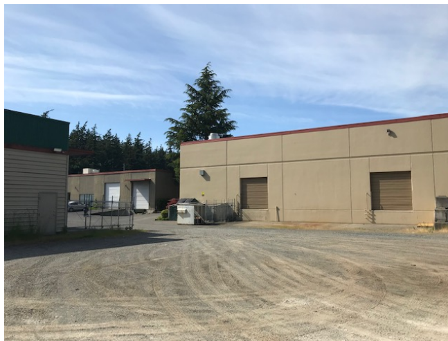
Lots of exterior space for truck maneuvering